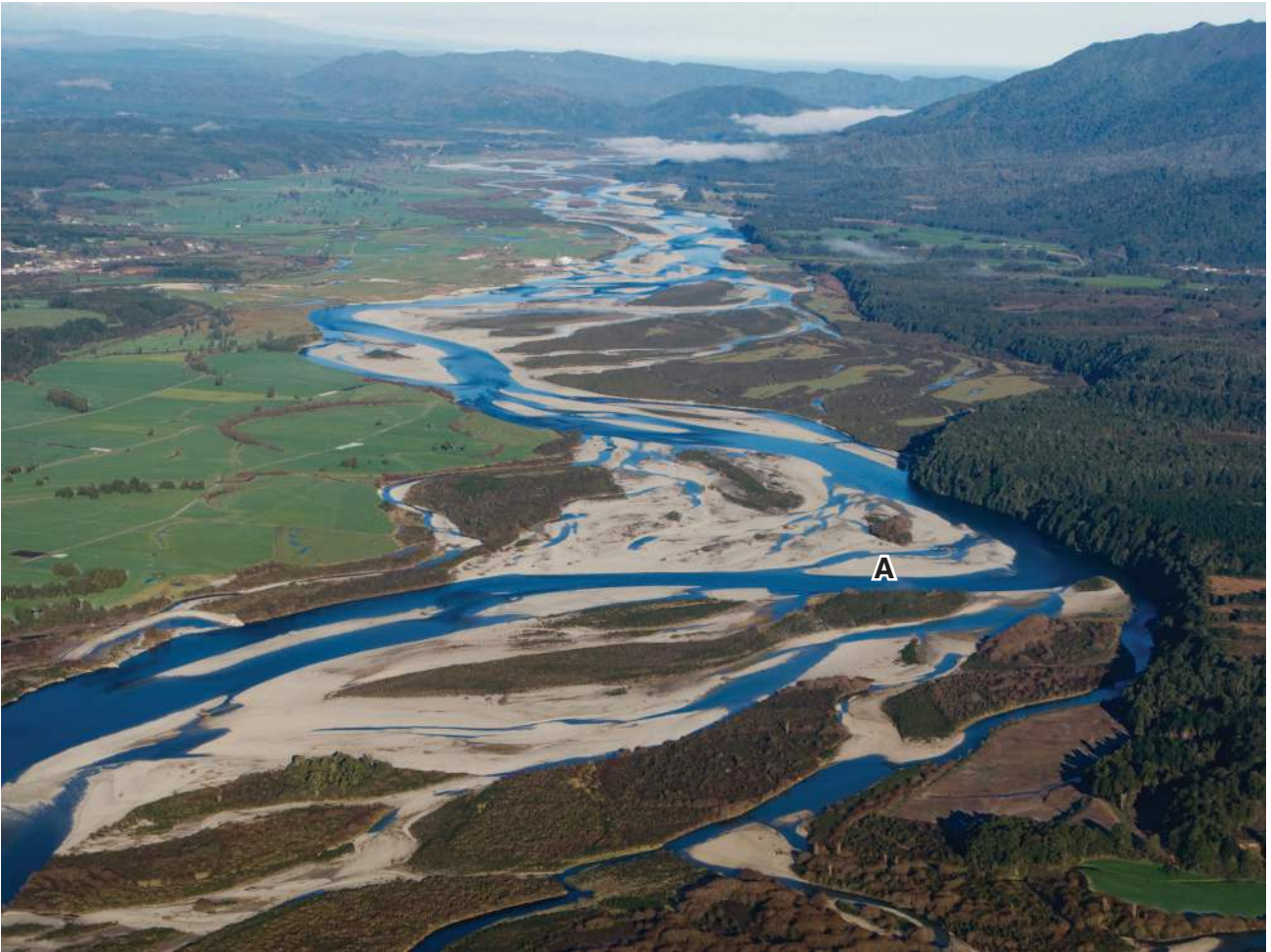
A braided river channel in South Island, New Zealand